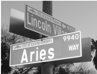
New street signs like these are popping up in LV.

Since last year, we have worked closely with our city government by inviting them to contribute to the process: whether it's a city council member, the Chief of RC Police, or a delegate from Cordova Parks, our twice-monthly meetings are productive, well-attended, and the subject of talk at city council meetings! As a result of our efforts, LVNA was featured in the December 14th issue of the Sacramento Bee , a fact unheard of for a neighborhood association in its infancy.